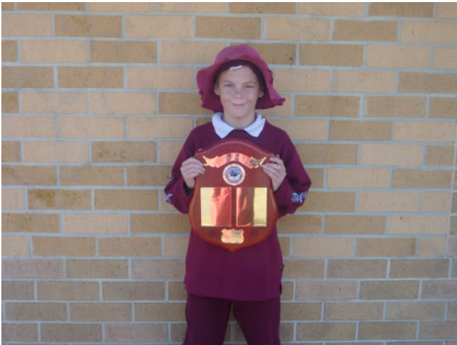
Ball Games carnival winners were Hastings